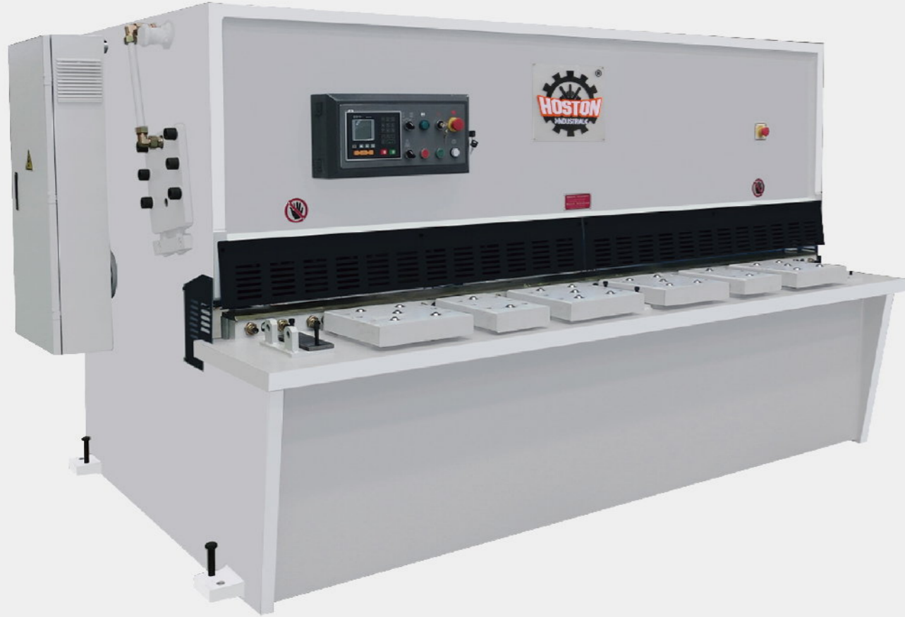
HBS SERIES HYDRAULIC SWING BEAM HBS 系列液压摆式