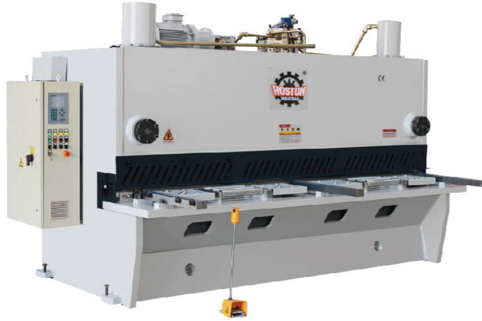
HGS SERIES HYDRAULIC GUILLOTINE HGS 系列液压闸式